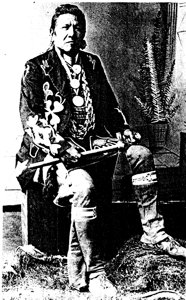
Western History Collections, University of Oklahoma Library