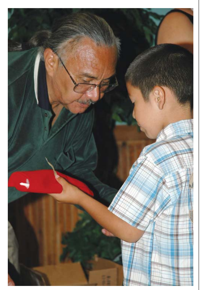
Young Indian graduate receiving an eagle feather.

Even with the Obama Administration's support, critical AI/AN provisions were not included in the ESEA reauthorization bill introduced in the Senate Committee on Health, Education, Labor, and Pensions (HELP Committee). In October, the HELP Committee passed out of Committee the reauthorization of the Elementary and Secondary Education Act of