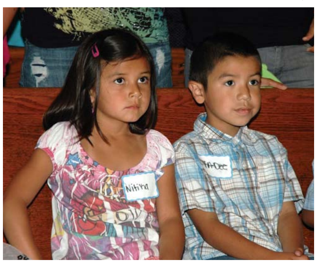
Young Indian graduates waiting for their recognition.

with a group of tribal education department directors from Indian tribes across the Country. Since its inception, NARF has hosted National meetings with TEDNA to 1) identify obstacles impeding educational tribal sovereignty, 2) develop policy initiatives to address such obstacles, and 3) advocate and provide \blacktriangleright