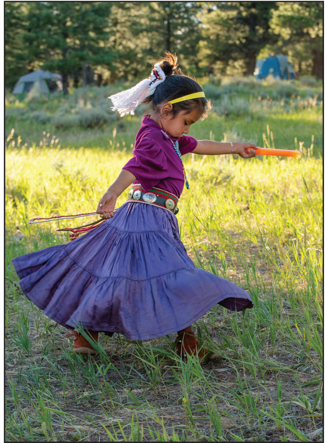
Girl, Bears Ears Summer Gathering.

Currently, members of Congress are trying to push through legislation to give the president the authority he seeks, ignoring standard legislative