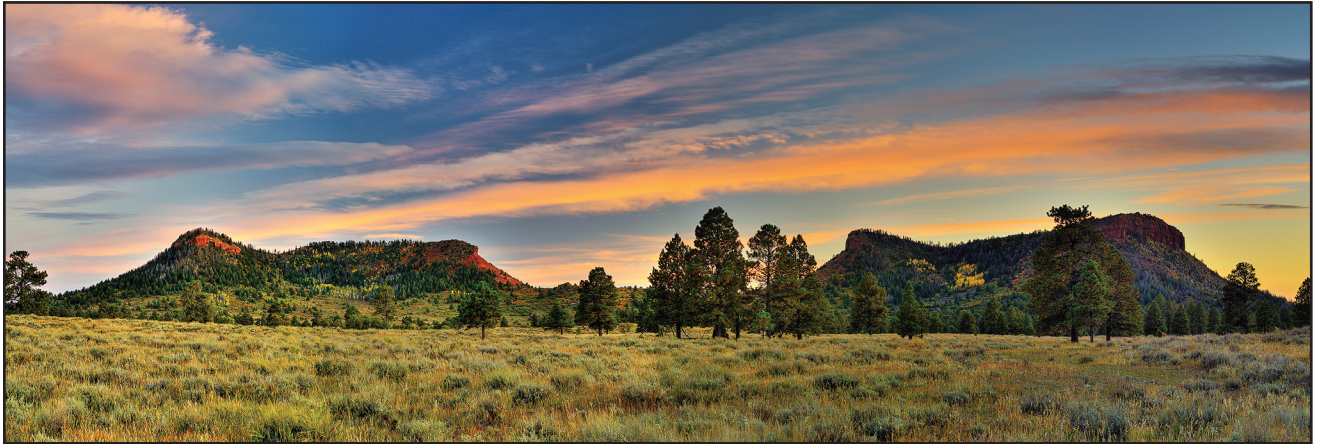
Bears Ears Fall Sunset.

Rising from the center of the southeastern Utah landscape and visible from every direction are twin buttes so distinctive that in each of the native languages of the region their name is the same: Hoon'Naqvut, Shash Jáa, Kwiyaqatu Nukavachi, Ansh An Lashokdiwe, or "Bears Ears." For hundreds of generations, native peoples lived in the surrounding deep sandstone canyons, desert mesas, and meadow mountaintops, which constitute one of the densest and most significant cultural landscapes in the United States. Abundant rock art, ancient cliff dwellings, ceremonial sites, and countless other artifacts provide an extraordinary archaeological and cultural record that is important to us all, but most notably the land is profoundly sacred to many Native American tribes, including the Ute Mountain Ute Tribe, Navajo Nation, Ute Indian Tribe of the Uintah Ouray, Hopi Nation, and Zuni Tribe.