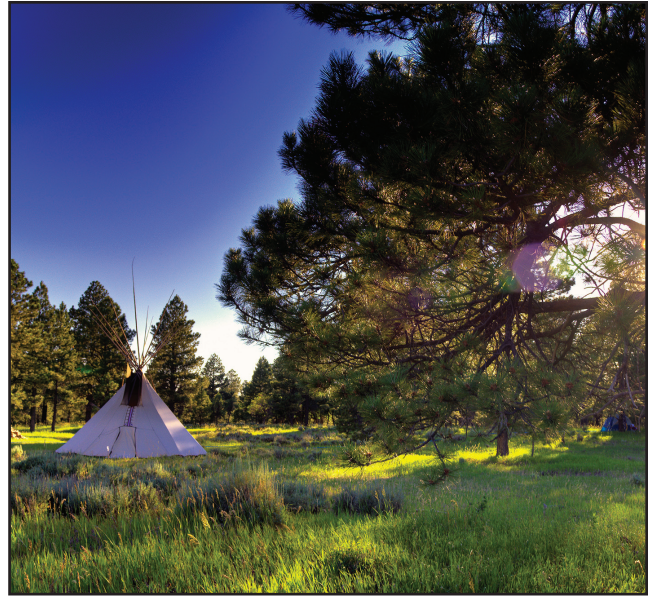
2016 Summer Gathering Sunray Tipi. Credit Tim Peterson

In December 2016, Congress adjourned without voting on Bishop's PLI. With this lack of legislative action, President Obama released his Bears Ears National Monument proclamation on December 28, 2016. The form of Obama's monument was a compromise between Bishop's Public Land Initiative and the Coalition's Bears Ears Proposal. At 1.35 million acres, the Monument's boundaries were closely aligned to those of the PLI, but the proclamation also included a management plan that empowered tribal leaders to provide guidance and recommendations on care of their ancestral lands. The designation was the culmination of local activism, coordinated out-