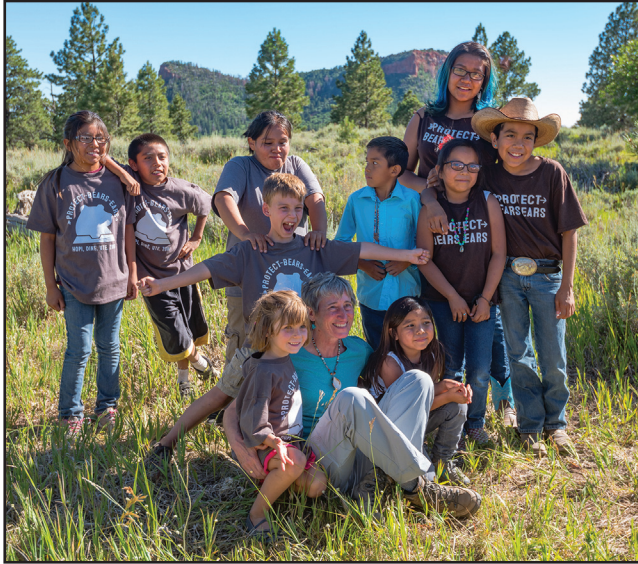
Kids and Secretary Jewell at Bears Ears Summer Gathering 2016.

Tribes in the region continue to use the Bears Ears region to collect plants, minerals, objects, and water for religious and cultural ceremonies and medicinal purposes. Native people hunt, fish, and gather within Bears Ears, and they provide offerings and conduct ceremonies on the land. In fact, Bears Ears is so culturally and spiritually significant that some ceremonies use items that can only be harvested from Bears Ears. Bears Ears is in every way a home to the region's Native people.