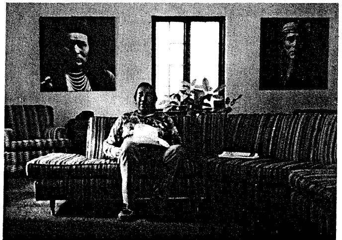
Shown here is a member of the Traditional Kickapoo visiting NARF's Boulder office while travelling south through Colorado with other tribal members on their annual migration through the midwest following the harvesting as migrant laborers.