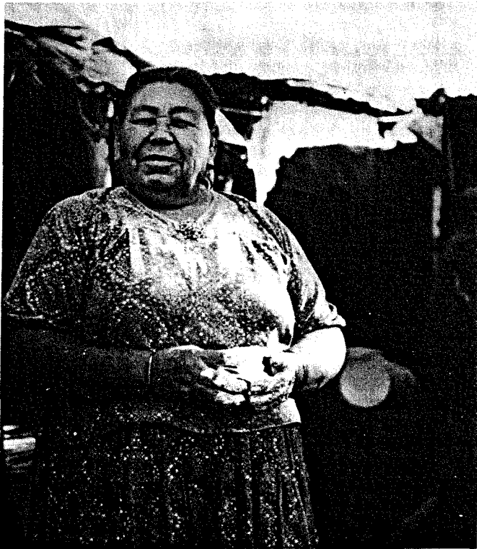
A Traditional Kickapoo pauses briefly during meal preparation at Eagle Pass.

The Kickapoo are beset by massive unemployment. Few jobs are available in Eagle Pass. As mentioned above, the chief source of employment is migrant labor in northern states during the summer months. Some travel as far as North and South Dakota and into Montana and Wyoming to follow the harvesting.