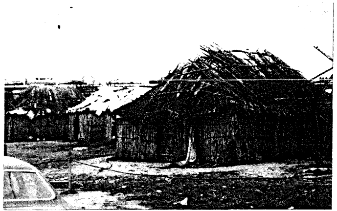
Although the materials used to build the huts at Eagle Pass have changed, they are still built in the traditional style.

The Kickapoo live in squalor in Eagle Pass. Some 600 tribal members must share one outdoor toilet and one water faucet. Diseases are epidemic. In 1978, the Texas Department of Health found that over 50% tested positive for tuberculosis. There was also a high incidence of diabetes, hypertension, and cardiovascular diseases. The report concluded: "We are of the opinion that an imminent threat to public health exists in the Kickapoo community." Since then conditions have worsened.