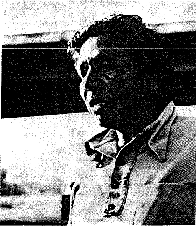
A member of the Tribe at Eagle Pass, with the International Bridge in the background overlooking the Kickapoo Village.