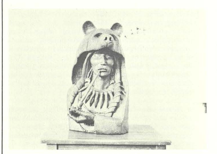
Walnut sculpture by Eddy Running Wolf

As one of the country's leading Indian organizations, NARF believes strongly in promoting this important aspect of Indian life. Likewise, the support of NARF's work by participating artists nationwide is extremely valuable in our efforts to promote self-determination for Native Americans. Plans are already underway for next year's show, hoping to make it even bigger and better than this year's.