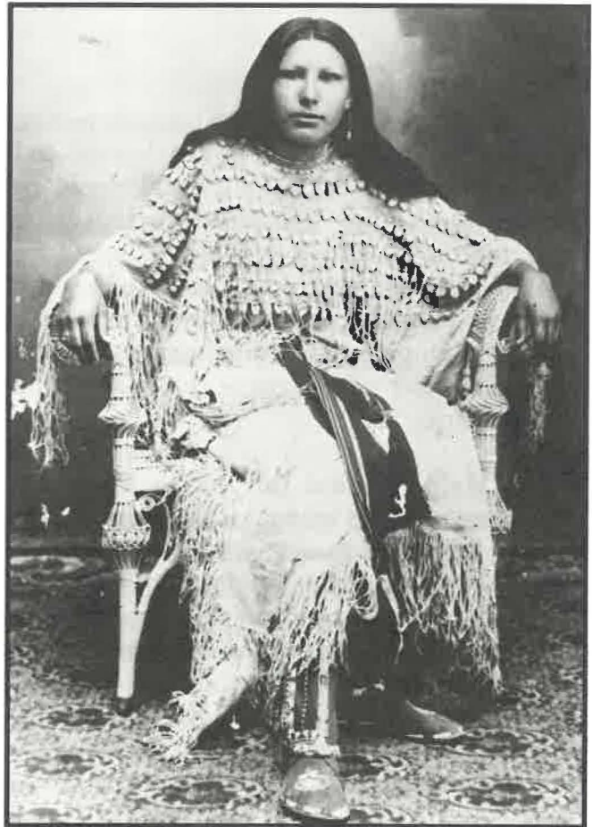
Western History Collections University of Oklahoma Library