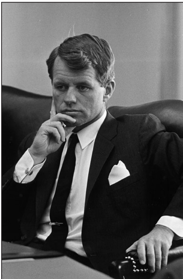
NATIVE AMERICAN RIGHTS FUND

Over the years the IEA's formula grant program, along with IEA discretionary grants, teacher training programs, graduate school fellowships, and national activities grants have helped tribal students. Precisely how many students wouldn't be where they are today without the IEA we may never know. Yet every time the ESEA gets reauthorized, there are those in